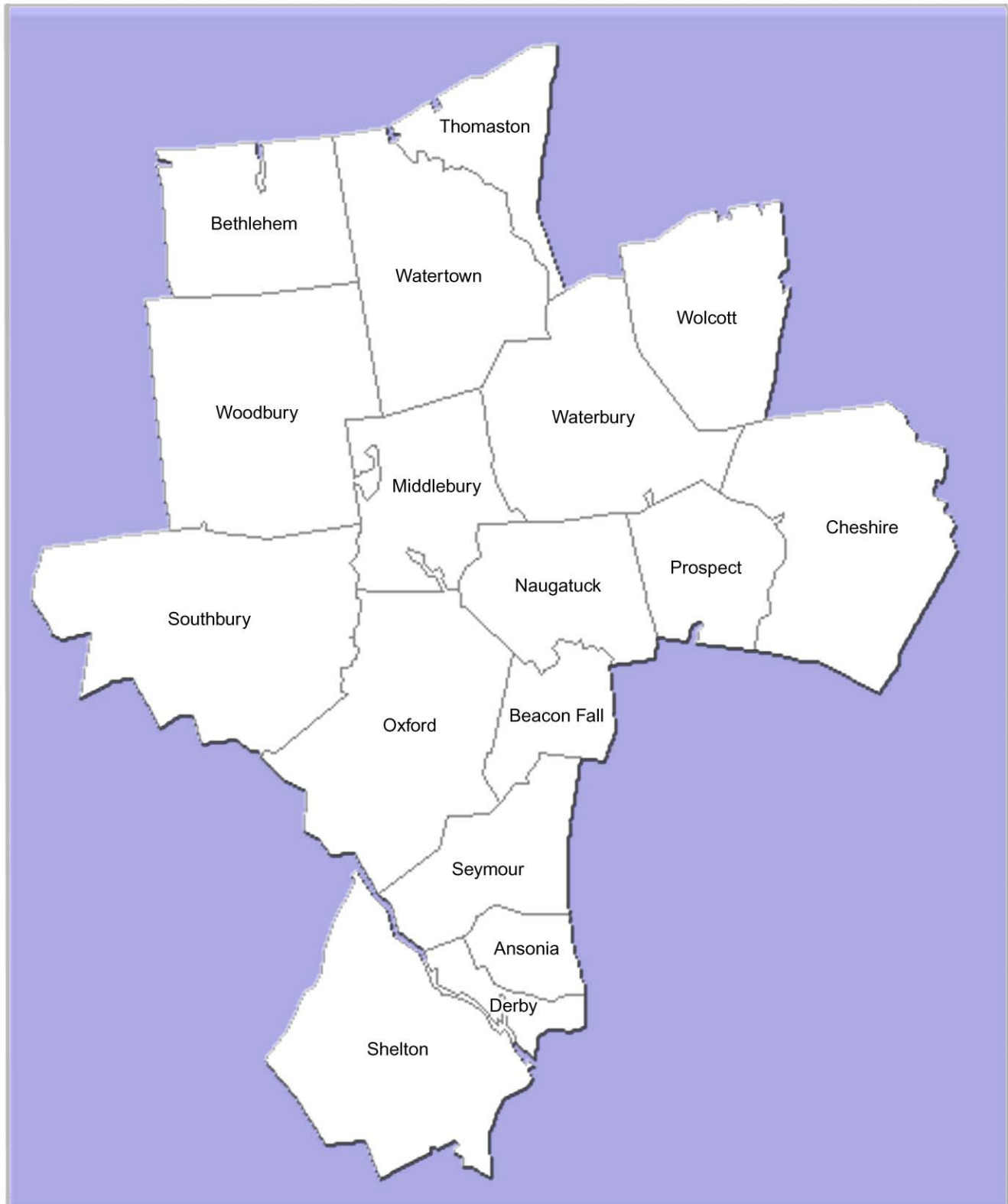
17 Community Strategy Area

Naugatuck Valley Development Corporation (NVDC) Shelton Economic Development Corporation (SEDC)